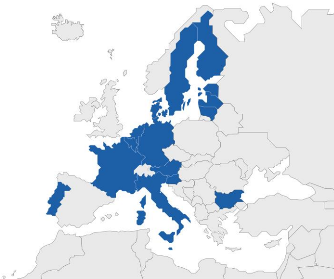
Member states of the EPO

In dark blue: 17 states participating in the Unitary Patent :